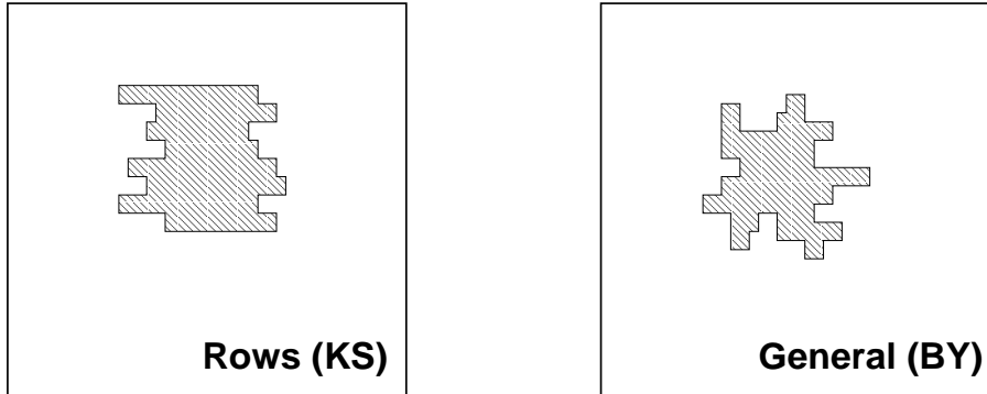
Figure 1: Alternative error models.

into a large image of size n \times n , which they solve in O(m^2 n^2) time using a generalization of the classical one-dimensional algorithm.