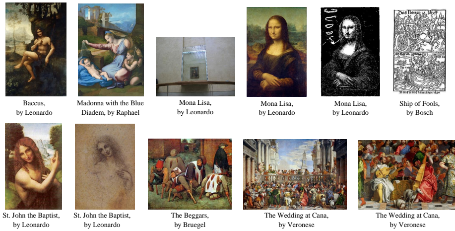
Fig. 1: Images of the WIKIPEDIA articles about paintings from the 16 th century displayed at the Louvre.